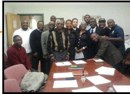
AFRICOM meets with FEMA and the SBA