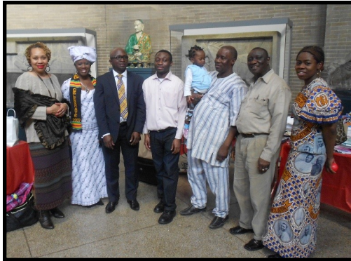
AFRICOM at the Penn Museum

videos, music and more for museum-goers. Mr.