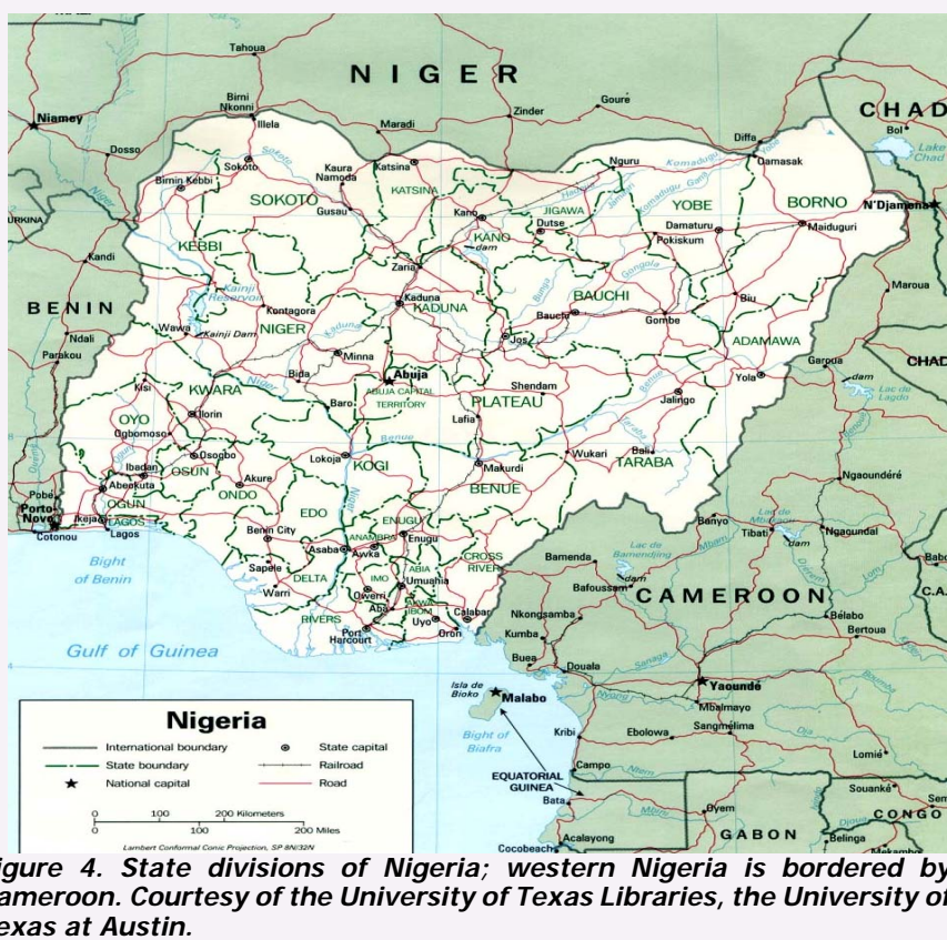
Figure 4. State divisions of Nigeria; western Nigeria is bordered by Cameroon.

In venomous snake bites, fangs produce a pair of deep puncture wounds which are susceptible to infection. At the Ahmudo Bello University Hospital,