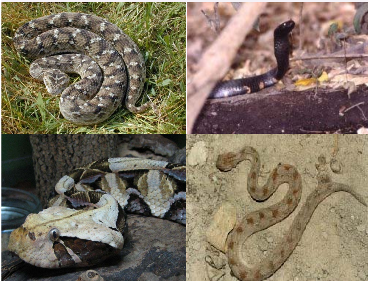
Figure 3. Clockwise from top left: Bitis arietans, Naja nigricolis nigricolis, Echis ocellatus, Bitis gabonica.

The EchitTab Study Group of Liverpool, England, conducted 2 separate studies on snake bite envenomation in Nigeria.(1) The first study was a 5-year (1989 to 1993) epidemiological survey, used to assess the magnitude and distribution of snakebites in Nigeria.(1) Dividing Nigeria into 1,600 high prevalent areas and 3,200 low prevalent areas, data was collected randomly from households and all of the surrounding health care facilities. Findings showed that Taraba State had the highest number of cases (900), while Jigawa State had the highest frequency (20/1000 admitted due to venomous snake bite) and case fatality rate (31%). The highest percentage of cases took place in patients between the ages of 10 and 29 years old, and the majority of patients stayed in the hospital from 1 to 2 days. The second study was conducted at the Kaltungo Hospital, Gombe State, from 1999 to 2006.(6) Here they assessed characteristics of patients and snake bite rates over time. It was determined that the majority of patients were farmers and students, 75% male. Most patients were 11 to 20. Snake bites rose in April and peaked in October, which coincides directly with the